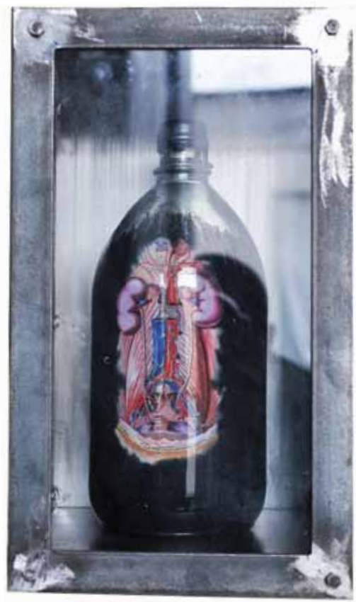
Human Liver 人体器官, 2010, glass bottle, steel case, oil paint, mineral pigments 玻璃瓶、铁制外壳、油画色、矿物色内画, H41 x W24 x D22 cm

LIU Zhuoquan was born in Wuhan, Hubei Province in 1964; he currently lives and works in Beijing. He has exhibited in many galleries throughout China, including a solo exhibition at d-space, Beijing and group exhibitions at Songzhuang Art Museum, Today Art Museum, 798 Space Station (Beijing), Frontline Gallery (Shanghai) and Shenzhen Art Museum; internationally in France and Australia, as well as Art Stage, Singapore and the China Art Projects featured artist in ARTHK11.