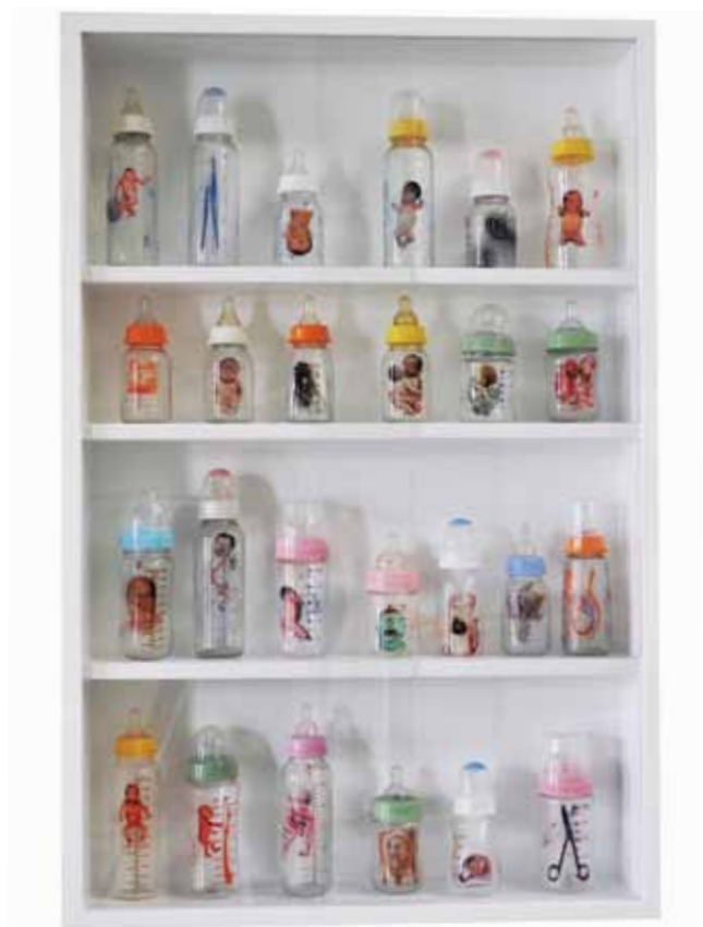
Milk Bottles and Babies 奶瓶与异形, 2010, 25 glass bottles, mineral pigments 25个玻璃瓶、矿物色内画, H97 x W64 x D11.5 cm