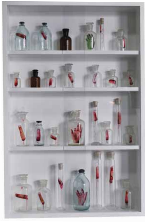
Broken Finger 02 断指02, 2010, 28 glass bottles, mineral pigments 28个玻璃瓶、矿物色内画, H98 x W64 x D11.5 cm