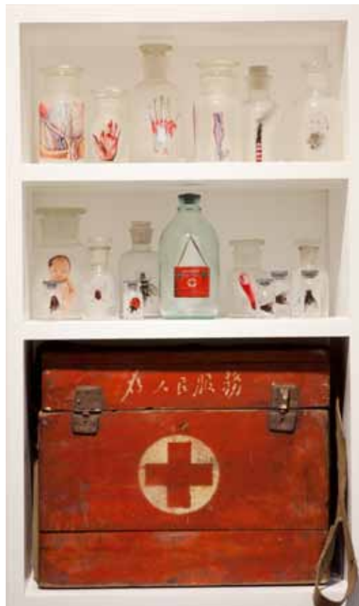
Medical Box 药箱, 2010, 17 glass bottles, wooden box, mineral pigment 17只玻璃瓶、木箱、矿物色内画, H60 x W40 x D25 cm

Old Things 旧物, 2010, 12 glass bottles, mineral pigments 12只玻璃瓶、矿物色内画, H66.5 x W63.5 x D12 cm