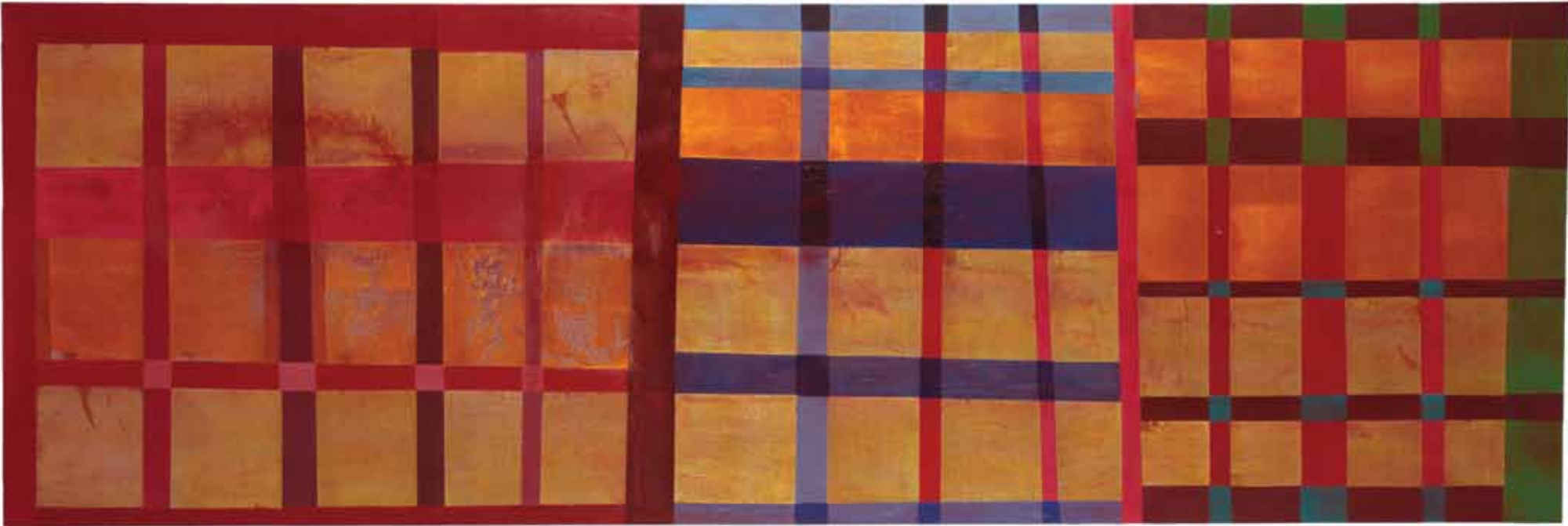
Geometrics No. 1 几何学图形 No. 1 , 2011, acrylic & pigment on canvas 丙烯酸酯和画布颜料, 300 x 100 cm