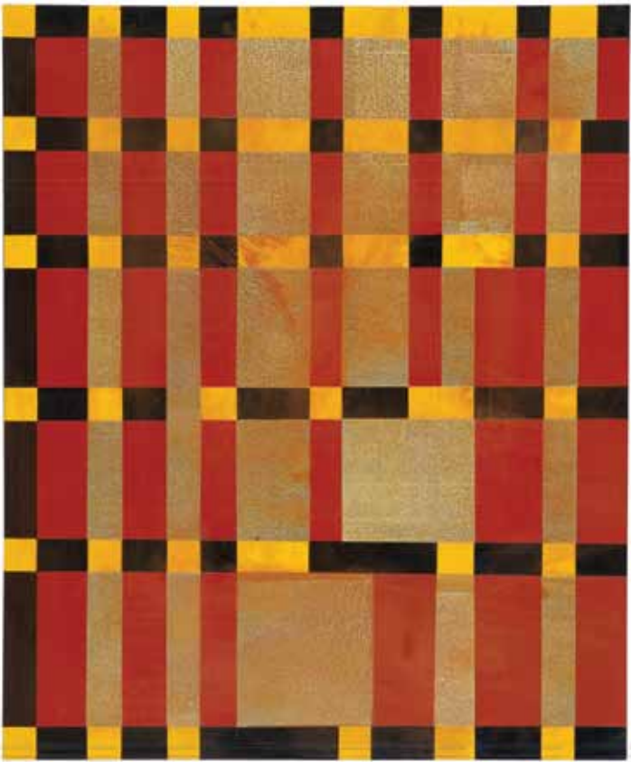
Geometrics No. 2 几何学图形 No. 2 , 2011, acrylic & pigment on canvas 丙烯酸酯和画布颜料, 120 x 100 cm