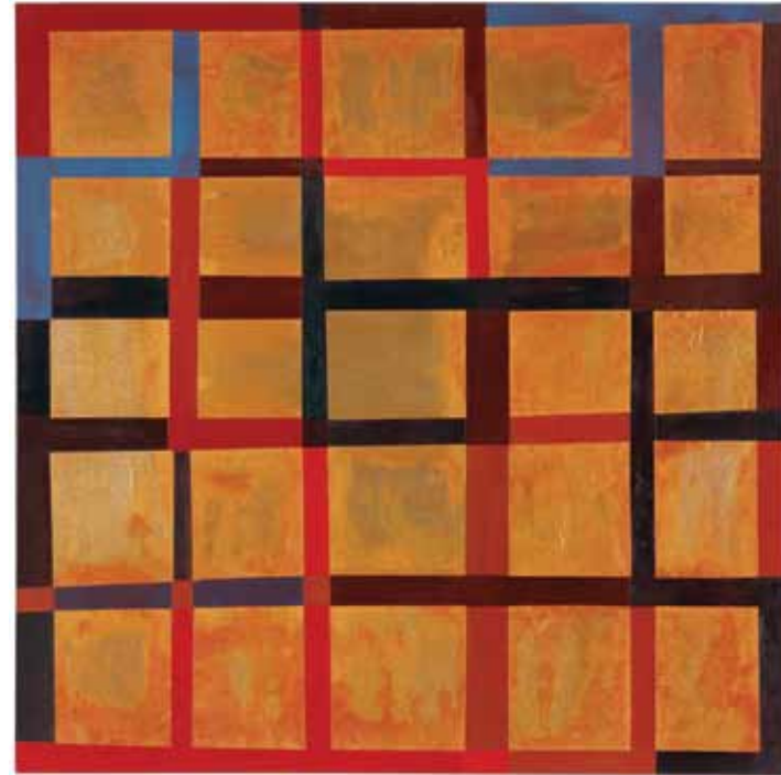
Geometrics No. 7 几何学图形 No. 7 , 2011, acrylic & pigment on canvas 丙烯酸酯和画布颜料, 100 x 100 cm