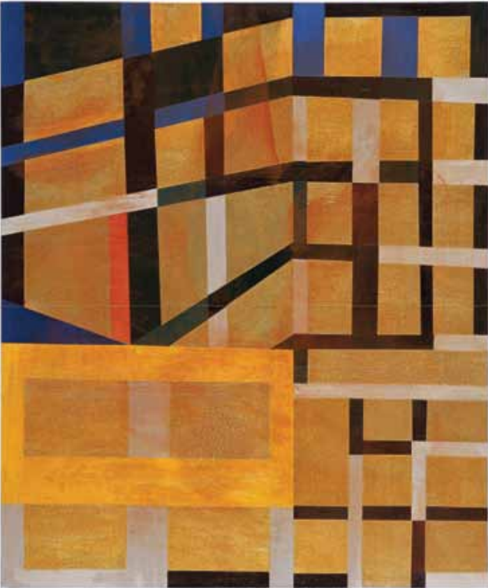
Geometrics No. 5 几何学图形 No. 5 , 2011, acrylic & pigment on canvas 丙烯酸酯和画布颜料, 120 x 100 cm

个展(有选择的) 2007年神殿几何学，上海红寨画廊。2006年十年以来，香港艺穗会俱乐部。2005年两次旅行，墨尔本Maroondah画廊；新的旅行，墨尔本Span画廊；海市蜃楼，北京红门画廊。2003年十年，东京Kato画廊。2002年着陆，澳大利亚高级理事会，新加坡。 联展(有选择的) 2011发现/迷失，北京奥沙画廊，2010年，张贴EDEN，北京今日美术馆；北京建筑景观，我的照片画廊，北京；这里和墨尔本大学，在北京艺术；2009年交易的意义，北京DAC画廊；明亮的黑暗，悉尼威廉姆国王街画廊。2008年中国艺术项目启动展，北京平行线空间；明亮的黑暗，布雷伯特瑞画廊，德国柏林；进程一旅行，北京红门画廊，上海东廊画廊，香港SINO空间。2005年海拔，Shepparton画廊，澳大利亚维多利亚；流浪，Kunstlerhause，奥地利维也纳；全球融合，维也纳，墨尔本；北京艺术博览会，墨尔本艺术博览会，红门画廊。2003年抽尘，墨尔本，香港，北京。 获奖情况 澳中理事会访问艺术家，Arts Victoria，澳大利亚驻华使馆外事和贸易司及驻香港、广州、新加坡的北京—澳大利亚高级理事会的艺术奖金。 受委托项目 北京君悦饭店、墨尔本皇冠大酒店、澳大利亚国家银行、澳大利亚国家银行伦敦分行、东京渣打银行、北京柏悦酒店、澳门皇冠酒店和香港四季酒店等。 收藏 托尼·苏格特的作品被多家政府机构和私人收藏，包括：澳大利亚驻华使馆、澳大利亚堪培拉国家美术馆、维多利亚艺术中心、澳大利亚艺术银行。