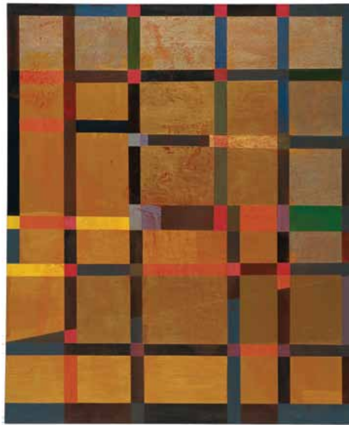
Geometrics No. 6 几何学图形 No. 6 , 2011, acrylic & pigment on canvas 丙烯酸酯和画布颜料, 120 x 100 cm