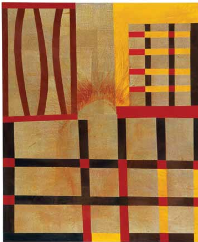
Geometrics No. 8 几何学图形 No. 8 , 2011, acrylic & pigment on canvas 丙烯酸酯和画布颜料, 120 x 100 cm